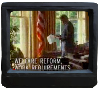
Clinton/Gore '96 ad

A new poll by Communication Concepts, conducted May 31 to June 3, surveyed over 620 Pennsylvanians. The results were clear: Voters still back commonsense welfare reform.